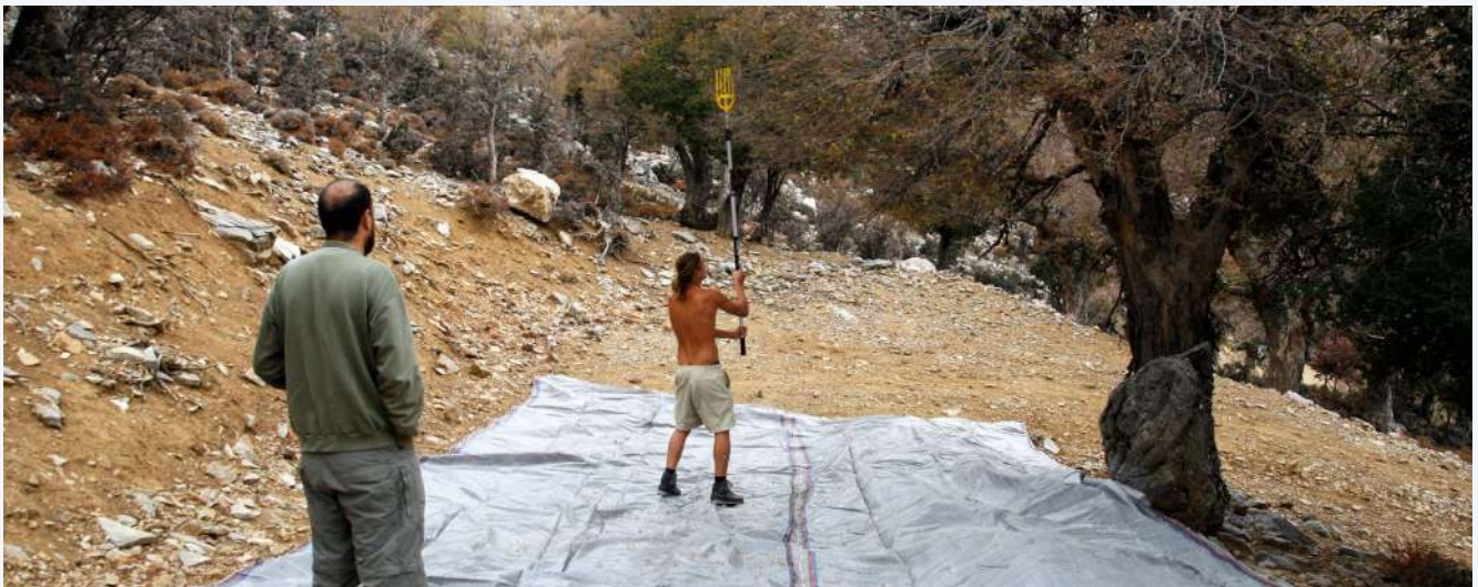
Fruit collection of Z. abelicea (17)