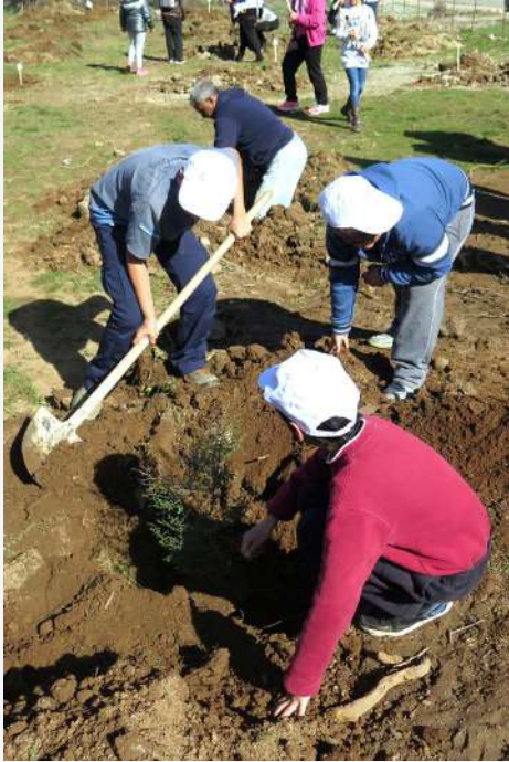
Planting event Omalos plantation, Lefka Ori (14)