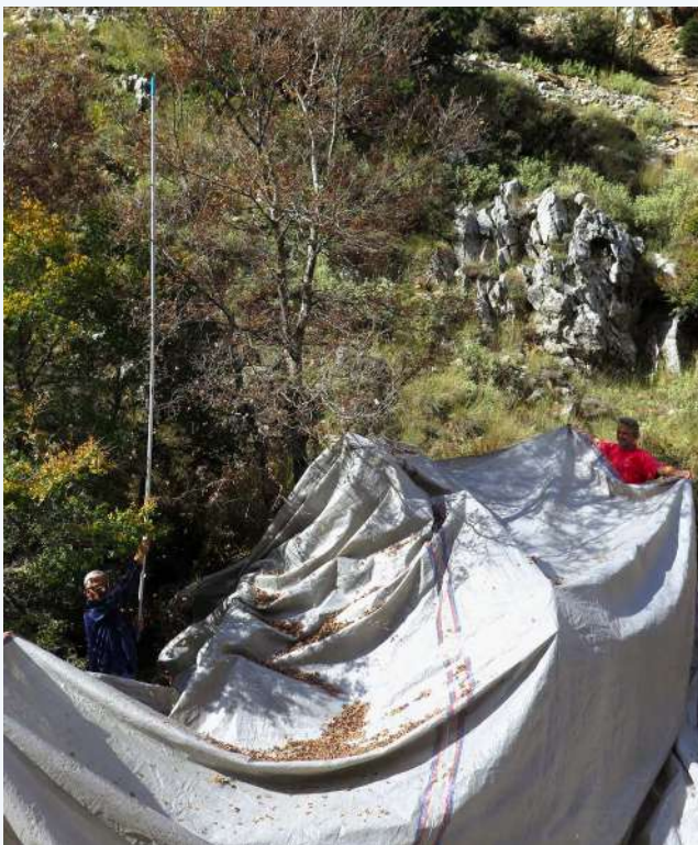
Z. abelicea fruit collection Lefka Ori, Omalos (4)

PROMOTE AND ENCOURAGE the use of Z. abelicea in future forest plantations carried out by both public bodies (e.g., Forest Directorates) or private owners, especially on sites that could be preliminarily considered not affected by the current conservation issues (e.g. overgrazing, misuse of wood resources, etc.) affecting the existing populations,