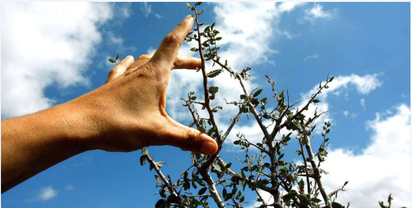
Z. abelicea shoot growth after browsing removal (9)

DIFFERENCES IN SOIL NUTRIENT CONTENT was found between fenced plots situated on slopes versus those situated on flat doline floors, but none of the investigated soil variables were important in determining Z. abelicea growth patterns.