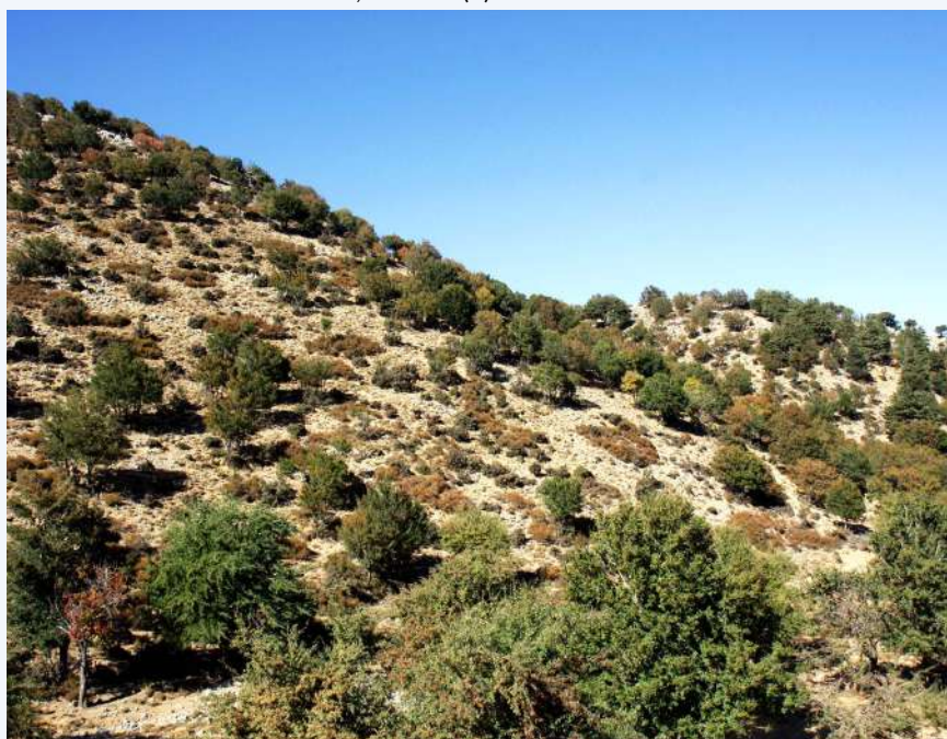
Habitat of Z. abelicea Lefka Ori, Omalos (2)

Following an intentional bottom-up structure, we present at first the guidelines and recommendation measures, then the results and outcomes of the Z. abelicea conservation project, the project aims and actions and we conclude by reporting general facts about Z. abelicea followed by a conclusive part.