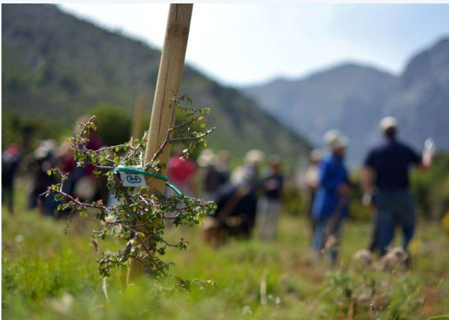
Plantation of Z. abelicea Lefka Ori, Omalos (13)

SECURING THE PRESERVATION OF THE GENETIC VARIABILITY OF THE SPECIES cannot rely only on the availability of plant material derived from fruits.