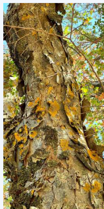
Xanthoria parietina and Pleurosticta acetabulum lichens on Z. abelicea Lefka Ori, Omalos (12)

DWARFED Z. abelicea individuals were found to have as much epiphytic diversity as normal growing individuals,