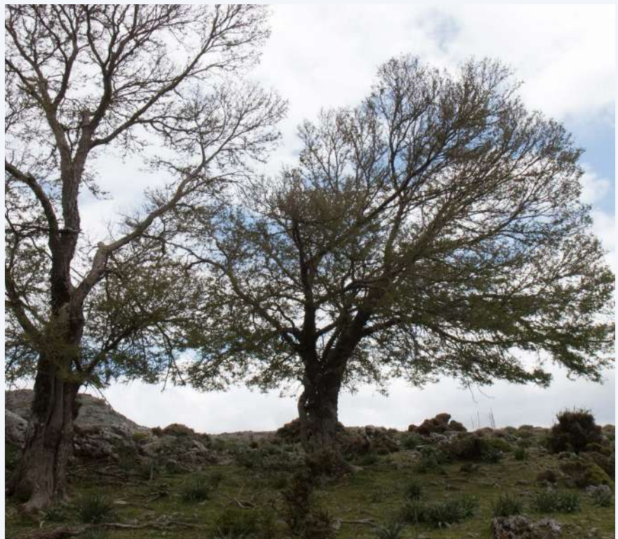
Z. abelicea tree form Lefka Ori, Imbros (3)

CREATE A NETWORK OF PLANT MICRORESERVES (PMRs) to protect the species in small land plots that are of peak value in terms of plant richness, endemism or rarity