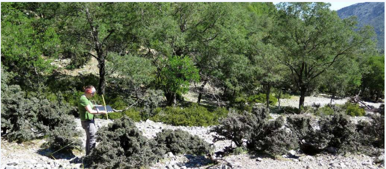
Z. abelicea dwarfed, shrub-like form vs tree form Lefka Ori, Omalos (19)

Soil erosion is the second most important disturbance - clearly correlated with intensive trampling and grazing. Climate change, water stress, fire as well as lack of public awareness represent additional threat factors. Moreover, the illegal pruning