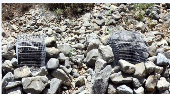
Mini-fences protecting seedlings of Z. abelicea Lefka Ori, Omalos (11)