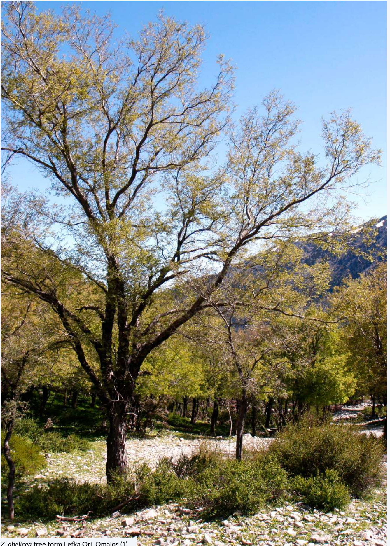
Z. abelicea tree form Lefka Ori, Omalos (1)