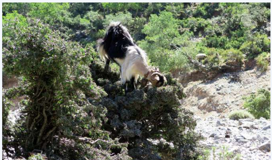
Overbrowsing by goats (21)

Given the level of threat to various populations, Z. abelicea is protected by the Greek legislation (Presidential Decree 67/1981) forbidding the use and collection of any of its parts (Fournaraki and Thanos, 2006, Rackham and Moody, 1996) and is included in the Red Data Book (Phitos et al. 1995). It has been also classified as Endangered (EN) in the IUCN Red List of Threatened Species (Kozłowski et al. , 2012). It is listed on Annex II of the Habitats Directive and under Appendix 1 of the Convention on the Conservation of European Wildlife and Natural Habitats (Bern Convention). Almost all the populations of the species are included in the Natura 2000 sites GR4320002, GR4320005, GR4330002, GR4330005 and GR4340008.