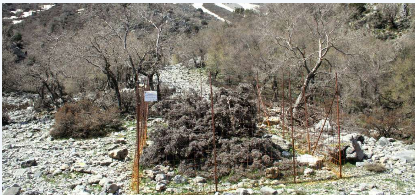
Small fence Lefka Ori, Omalos (8)

FENCING SMALL PLOTS (20 – 100 m 2 ) is efficient in allowing the protection and growth of Z. abelicea individuals,