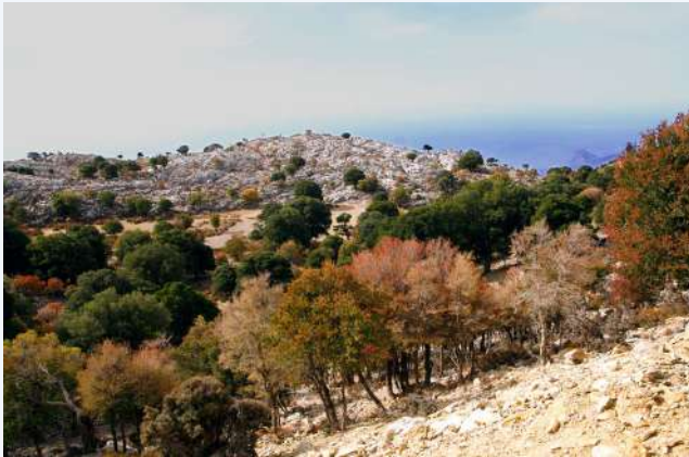
Habitat of Z. abelicea - Dikti, Protolitsa (18)

trees were pollarded and the leaves used as summer forage for the flocks (Bauer and Bergmeier, 2011, Rackham and Moody, 1996).