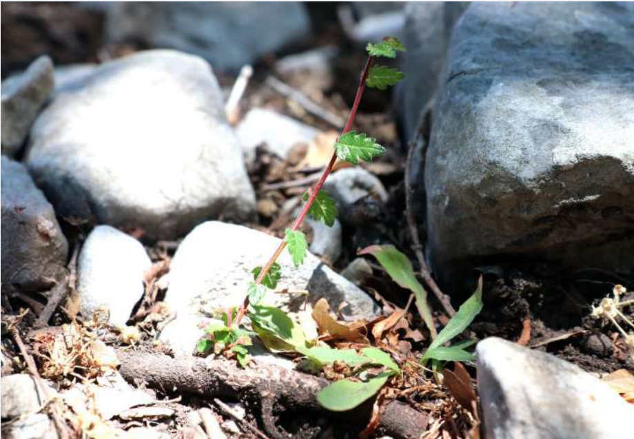
Z. abelicea - vegetative root suckers (20)

of trees to produce traditional walking sticks (katsouna) hinders the growth and development of fruiting trees (Bauer and Bergmeier, 2011, Egli, 1997, Kozłowski et al., 2012, Sarlis, 1987). Despite its threatened status and its relative rarity, Z. abelicea is an essential component of the Cretan mountains. Not only does it provide a unique ecosystem within its branches, bark and roots for numerous and poorly studied organisms such as epiphytic lichens and bryophytes (Fazan et al. , 2022b), micromammifers, microarthropods and birds, but it also shapes the environment by providing shade and shelter to, as well as co-growing with numerous rare or endemic plants of the Cretan mountains.