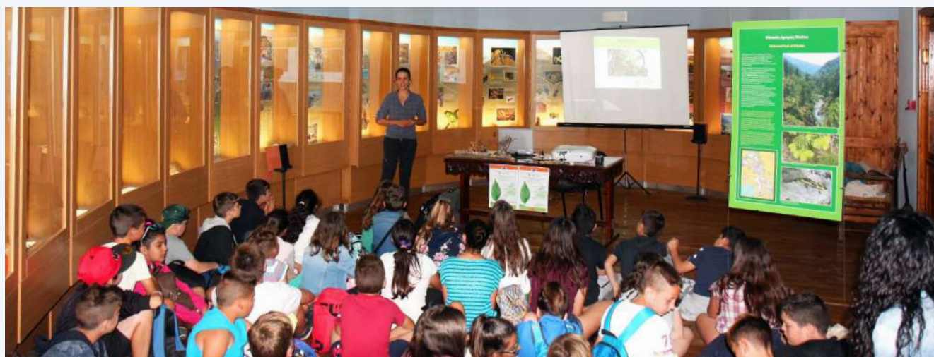
Communication and outreach activities (6)

IMPROVE THE LEGAL PROTECTION STATUS of the species, for example as “traditional umbrella species”, i.e. a species whose conservation improves the conservation not only of other co-occurring species but also at the ecosystem and landscape level,