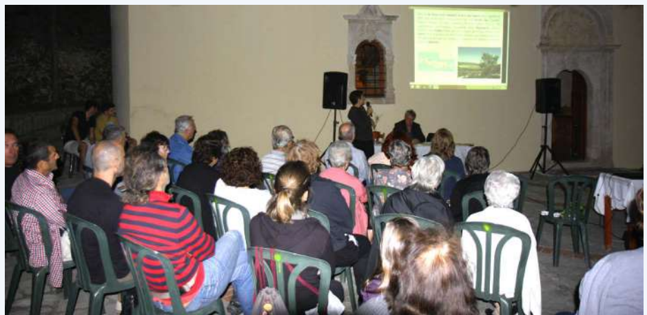
Local information event Kavousi, Lasithi (15)

These field findings and lessons learnt have important implications on future conservation actions of Z. abelicea , as they can help choose which stands and which individuals to protect in priority. Moreover, these findings are alarming for the long-term conservation of the species, at least outside of the Lefka Ori mountain range in western Crete and mainly in the eastern part (Dikti and Thripti) of its natural distribution range.