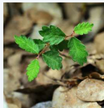
Seedlings of Z. abelicea naturally established in the wild Lefka Ori, Omalos (10)

SEEDLING SURVIVAL IN THE WILD was very rare, even in fenced areas, suggesting that the impact of summer drought could be of more importance than browsing pressure.