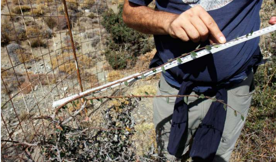
Monitoring the growth of Z. abelicea (16)

One of the main objectives of the 3 rd phase (2019-2021) of the project was to consolidate and capitalize on the results achieved during its 1 st and 2 nd phases to ensure their long-term effectiveness and sustainability and to define guidelines and recommendations for the long-term conservation of the species in Crete. In its 3 rd phase, the project carried on all the conservation and communication and outreach activities initiated in 2014, quantified the effect of excluding grazing and browsing on the growth of the species and on local vegetation dynamics, defined the relationship between abiotic and/or biotic factors and the growth rate of the species on different mountain ranges of Crete, engaged all relevant stakeholders in the process of conserving and protecting the species and capitalized on the positive results already achieved in its 1 st and 2 nd phase.